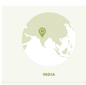
ENHANCING FOOD SECURITY OF WOMEN FARMERS

Thanks to the program, more than 3,600 farmers and 13 cooperatives were provided with technical and capacitybuilding support tailored to their production profile. Women farmers received training on farm management and compost production and were given additional agricultural equipment to facilitate harvesting.